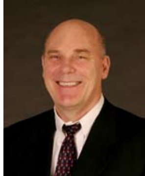
Head Coach Don Meyer